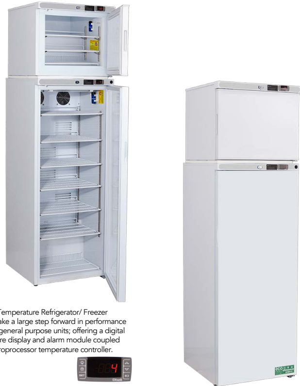
The Dual Temperature Refrigerator/ Freezer Combos take a large step forward in performance from past general purpose units; offering a digital temperature display and alarm module coupled with a microprocessor temperature controller.

These chambers come with a two year parts and labor warranty, plus an additional three year compressor parts warranty.